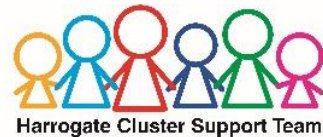
Harrogate Cluster Support Team